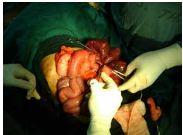
Figure 69.3: Resection of gangrenous bowel.