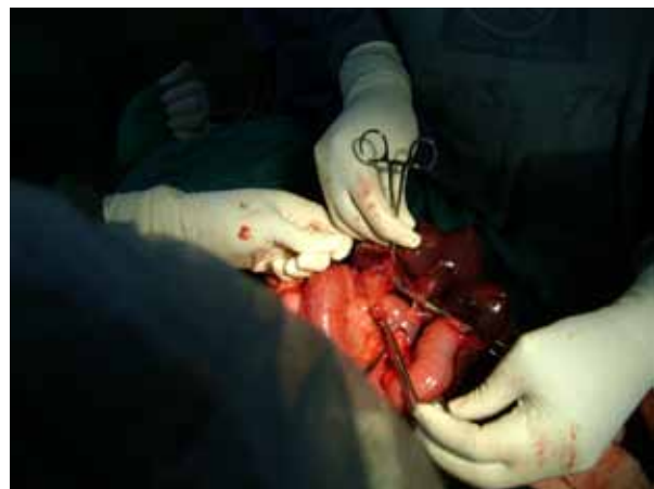
Figure 69.2: Dividing the adhesions.