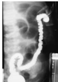
Figure 73.2: Barium enema of patient showing sigmoid atresia and distal microcolon.