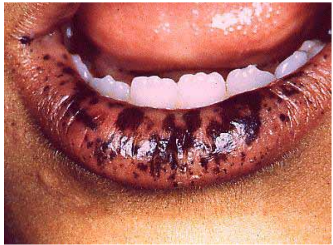
Figure 78.3: Oral pigmentation in an adult with Peutz-Jeghers syndrome.

Oral use of nonsteroidal anti-inflammatory drugs (NSAIDs, especially sulindac) has remained controversial, but it has been shown to cause regression of polyps in patients, especially if used after rectum-sparing surgery. Lifetime surveillance is still needed, however,