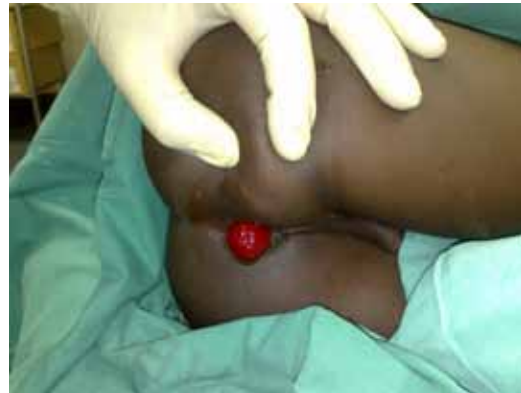
Figure 78.1: A prolapsed juvenile polyp prior to surgical excision in a 3-year-old girl.

Many polyps are located in the rectum and lower sigmoid colon and can be snared and removed through a flexible sigmoidoscope. Some of these lesions can be prolapsed through the anus and removed by suture ligation of the pedicle (see Figure 78.1). For higher lesions, a snare and cautery through a colonoscopy may be performed. It is rarely necessary to perform a laparotomy with colostomy for removal of a juvenile polyp. If more than five polyps are identified, a colonoscopic excision of the polyps should be performed. This latter clinical scenario of more than five polyps may indicate juvenile polyposis syndrome (see next section) and would place the child at risk for future colorectal malignancies. Complications after endoscopic removal of juvenile polyps have been rare. Perforation and subsequent bleeding from additional or recurrent juvenile polyps is believed to be approximately 5%. The natural history of juvenile polyps is that they are self-limited and seem to disappear, presumably by auto amputation.