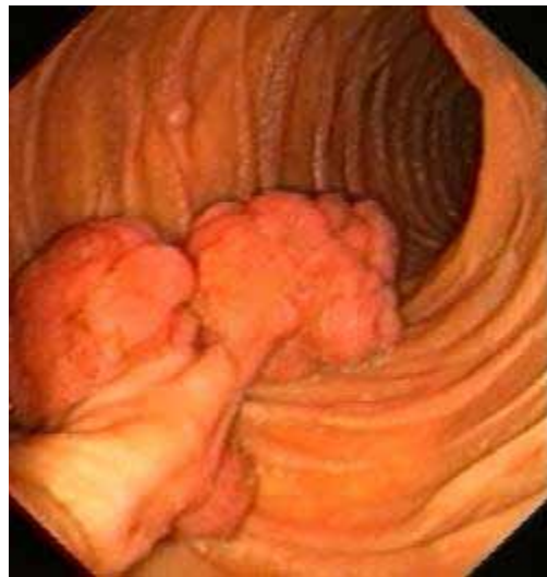
Figure 78.4: Duodenal polyp in a patient with Peutz-Jeghers syndrome.

as rectal carcinoma has been reported in these patients. The rare cases with MAP-type attenuated FAP can be spared surgery and instead have colonoscopic surveillance and regular snare polypectomies.