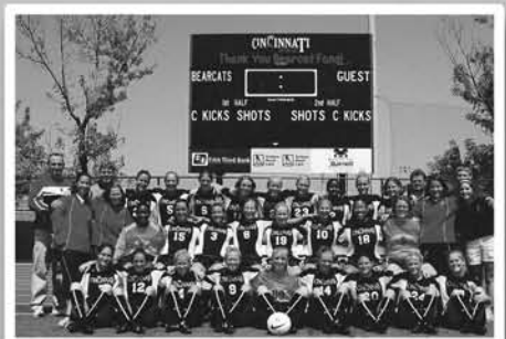
2002 - NCAA Tournament