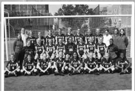
2001 - NCAA Tournament