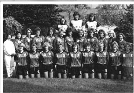
1986 - NCAA Tournament