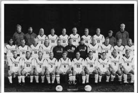
1997 - NCAA Tournament