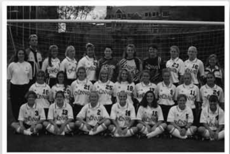
1994 - NCAA Tournament