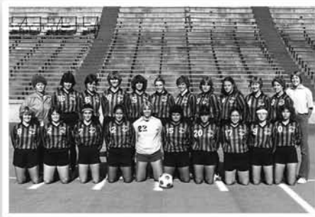
1981 - AIW Tournament