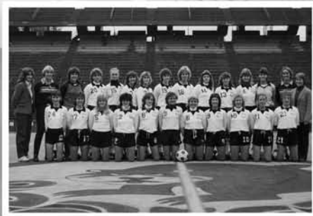
1983 - NCAA Tournament