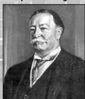
William Howard Taft