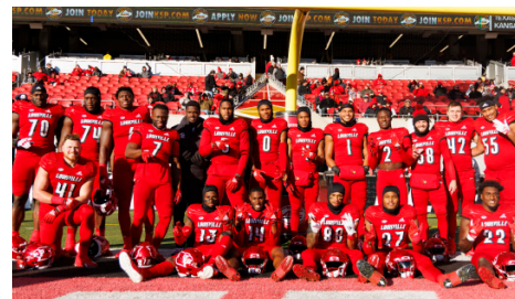
2022 SENIOR CLASS