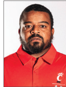
DALVIN JONES EQUIPMENT