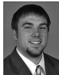
Jeremy Martin Sports Communications