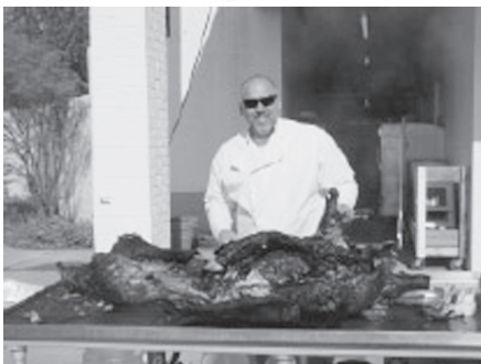
The Pig Roast has become an annual tradition at the Letterman's Weekend