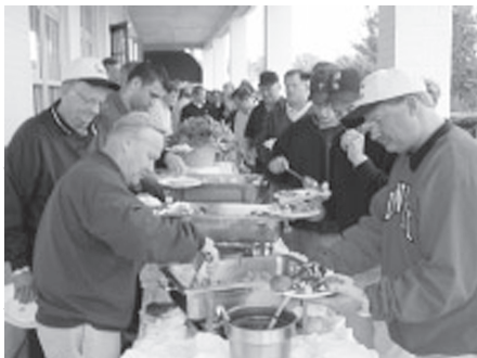
A few hungry Bearcats lead the way through the dinner line!