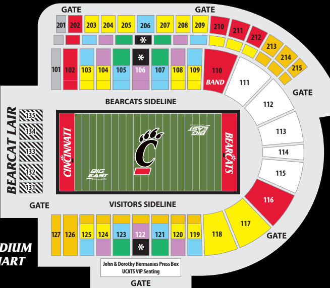
NIPPERT STADIUM SEATING CHART

GoBEARCATS.com • 1-877-CATS-TIX • CATSTIX.com