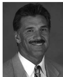
Dave Wannstedt Head Coach