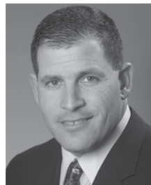
Greg Schiano Head Coach