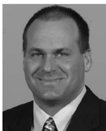
Rich Rodriguez Head Coach