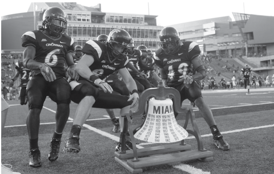
In 2006, the Bearcats recaptured the Victory Bell with a 24-10 victory over Miami (OH).