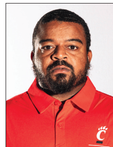
DALVIN JONES EQUIPMENT