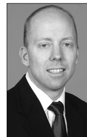
Mick Cronin Men's Basketball