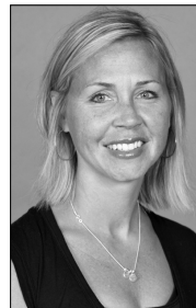
Lellie Swords Lacrosse