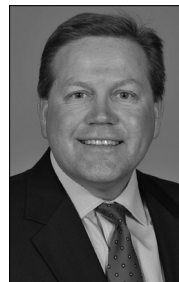
Brian Kelly Football