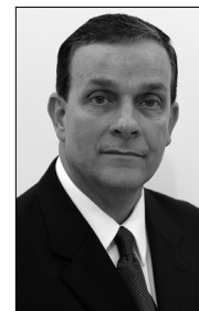
Kelley Hall Women's Basketball