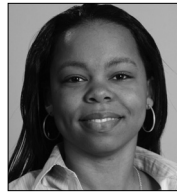
Kami Little Athletics HR Liaison