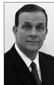
Kelley Hall Women's Basketball