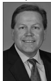
Brian Kelly Football