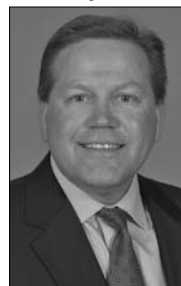
Brian Kelly Football