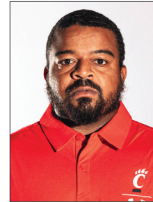
DALVIN JONES EQUIPMENT