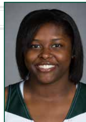
2017-18 Superlatives and Honors

Played in 62 games as a Spartan, starting 13 ... Scored 102 points as a freshman, playing in every game.