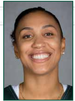
2016-17 Superlatives and Honors

Senior • 6-2 • Forward • Galloway, N.J./Wildwood Catholic