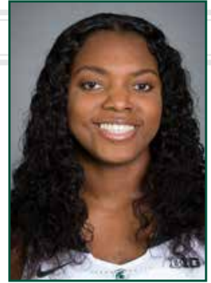
2017-18 Superlatives and Honors