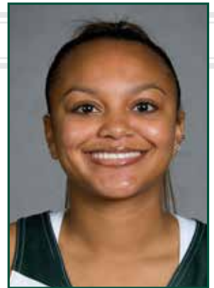
2017-18 Superlatives and Honors

Appeared in one game at Illinois (2/24) during her 2015-16 season.