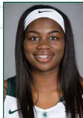
2017-18 Superlatives and Honors