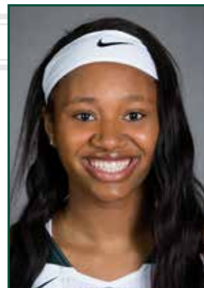
2017-18 Superlatives and Honors

Freshman • 6-4 • Forward • Kenosha, Wis./St. Joseph