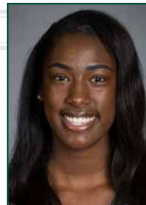
2017-18 Superlatives and Honors