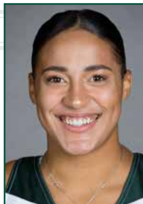
2017-18 Superlatives and Honors

Senior • 6-4 • Forward • Fishers, Ind./Notre Dame