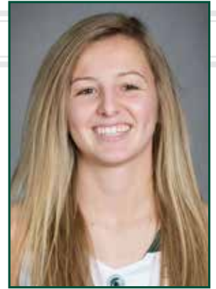
2017-18 Superlatives and Honors