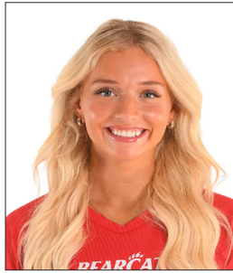
15 FAITH FRAME L/DS | GRETNA, NEB.