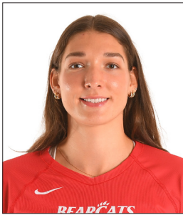
14 IRBE LAZDA RS | MARUPE, LATVIA