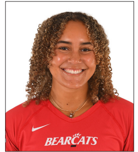
99 ZETA WASHINGTON MB | PONTE VEDRA, FLA.