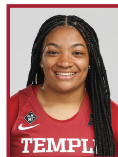
#12 EMAMI MAYO GR | 6 | 5-8 HEPHZIBAH, GA.