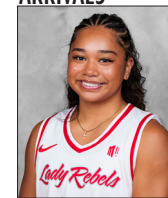
Ongolea Afu Transferred from Murray State College