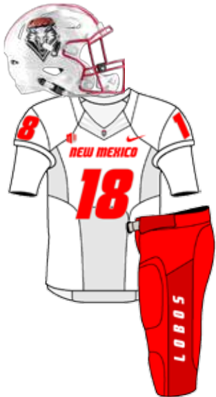
OCT. 6 AT UNLV