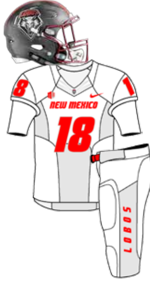
SEPT. 15 AT NEW MEXICO ST.