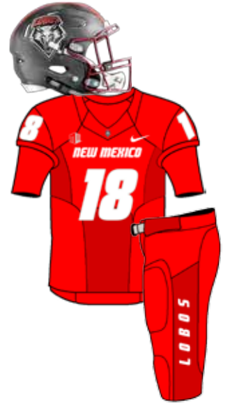
SEPT. 29 LIBERTY