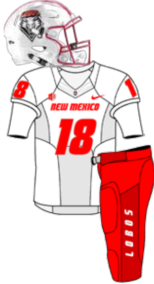
OCT. 13 AT COLORADO STATE