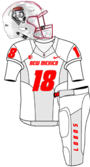
SEPT. 8 AT WISCONSIN