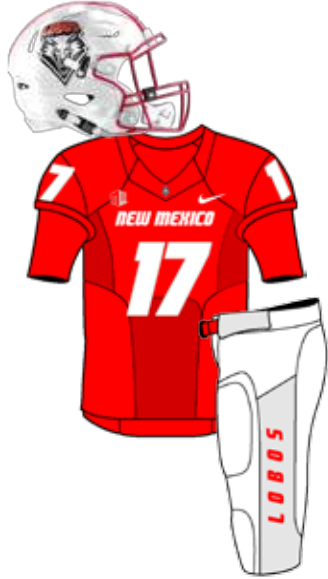
SEPT. 2 VS. ABILENE CHRISTIAN