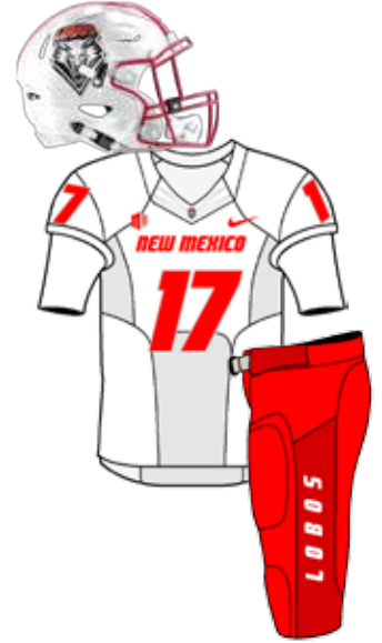
SEPT. 23 AT TULSA