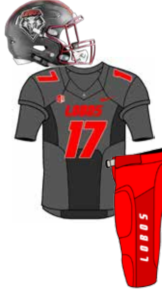
OCT. 20 VS. COLORADO ST.