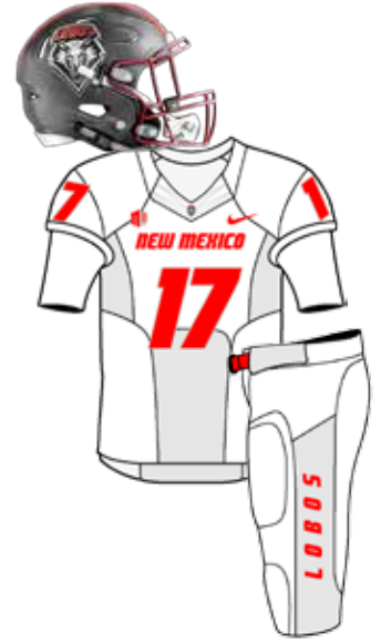
OCT. 28 AT WYOMING