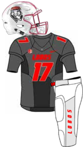
SEPT. 30 VS. AIR FORCE