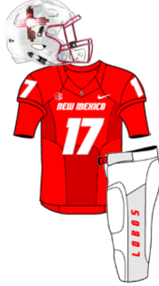
SEPT. 9 VS. NMSU