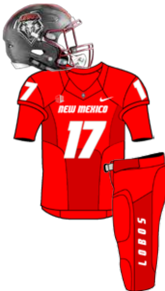
NOV. 4 VS. UTAH STATE