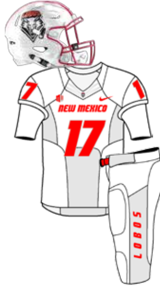
SEPT. 14 AT BOISE STATE