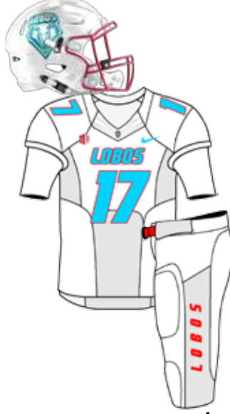
OCT. 14 AT FRESNO STATE