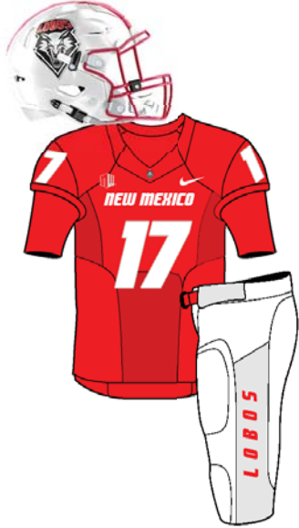
SEPT. 2 VS. ABILENE CHRISTIAN