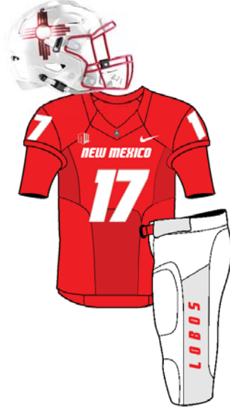
SEPT. 9 VS. NMSU