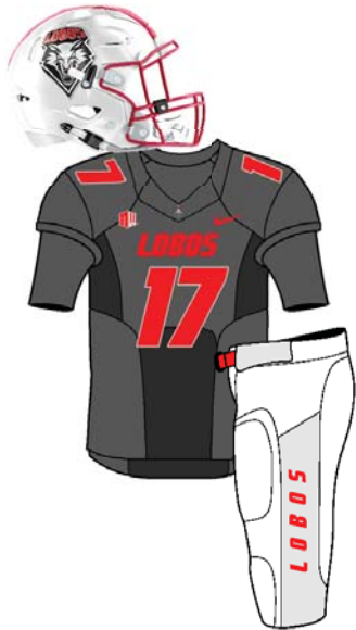
SEPT. 30 VS. AIR FORCE