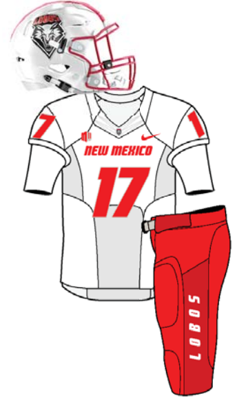
SEPT. 23 AT TULSA