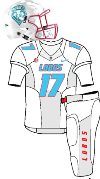
OCT. 14 AT FRESNO STATE