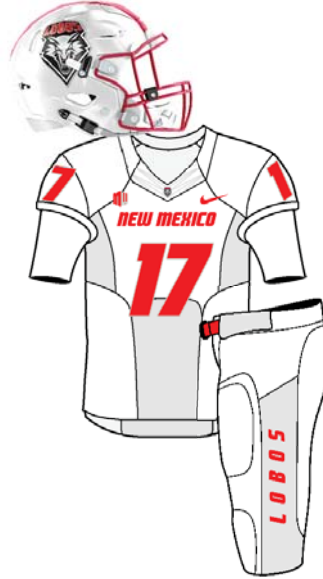
SEPT. 14 AT BOISE STATE