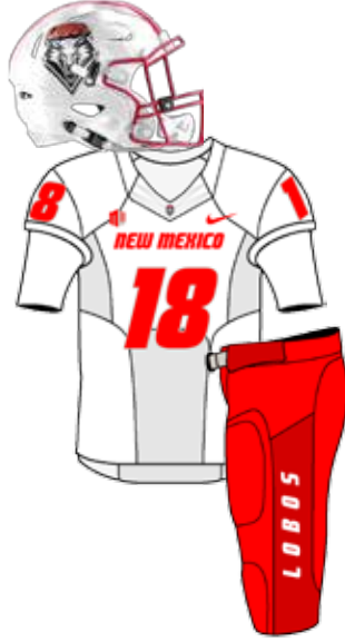
OCT. 13 AT COLORADO STATE