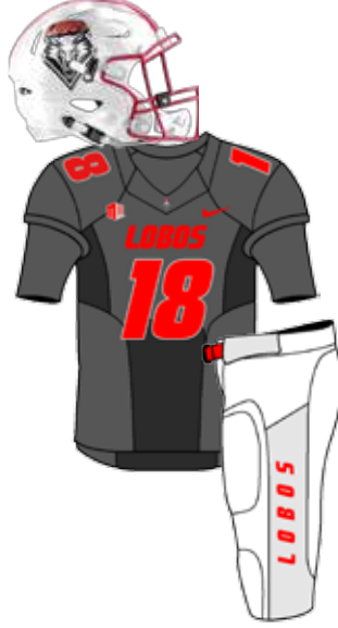
OCT. 20 VS. FRESNO STATE