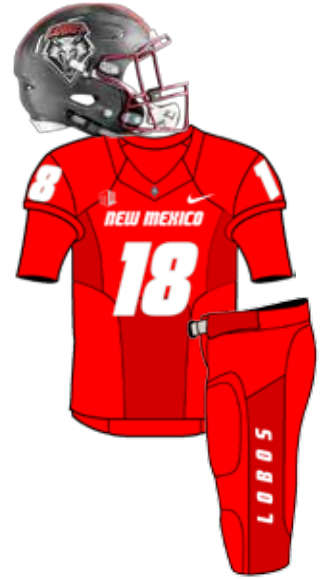
SEPT. 29 LIBERTY