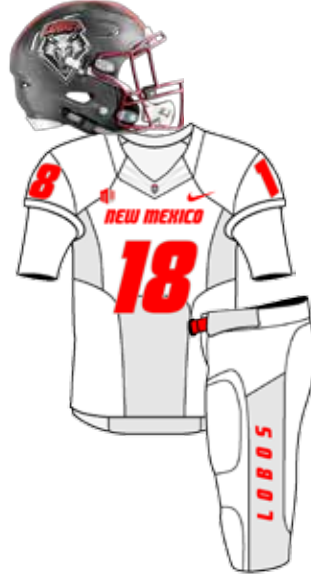
SEPT. 15 AT NEW MEXICO ST.