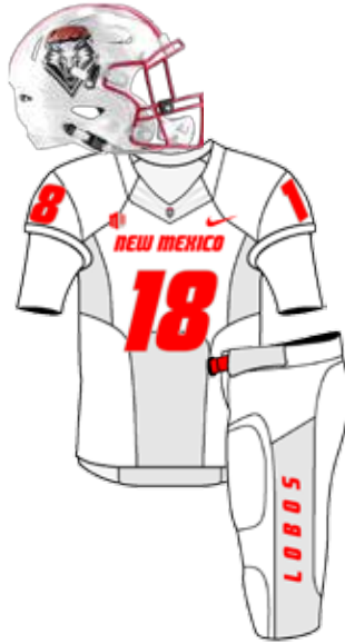
SEPT. 8 AT WISCONSIN