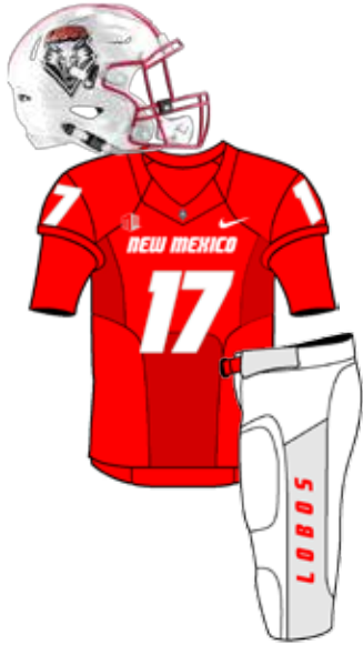
SEPT. 2 VS. ABILENE CHRISTIAN