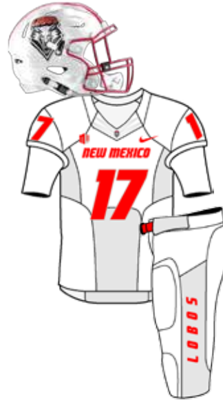
SEPT. 14 AT BOISE STATE