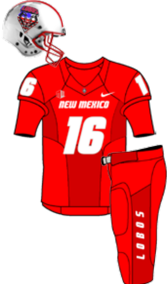
NOV. 5 VS. NEVADA