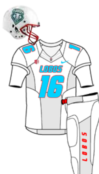
OCT. 15 VS. AIR FORCE