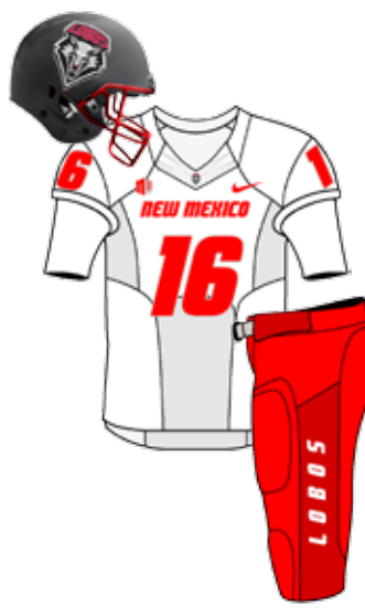
NOV. 19 AT COLORADO ST.