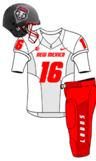
NOV. 12 AT UTAH STATE