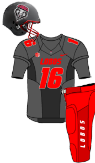
OCT. 22 VS. ULM