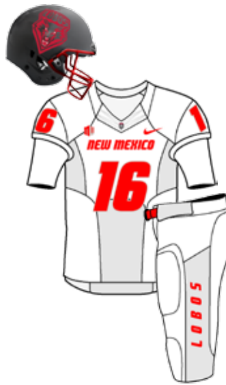
SEPT. 17 AT RUTGERS