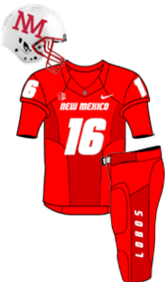
OCT. 7 VS. BOISE STATE