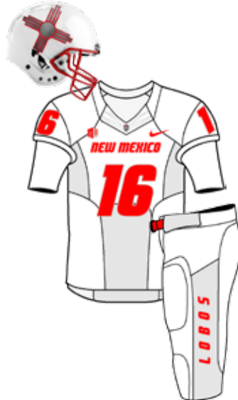
SEPT. 10 AT NMSU