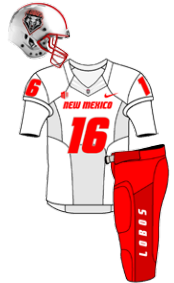
OCT. 29 AT HAWAII