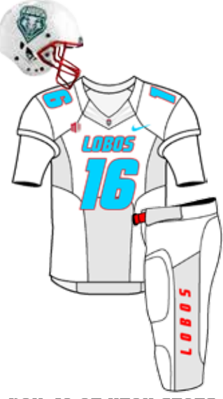
NOV. 12 AT UTAH STATE