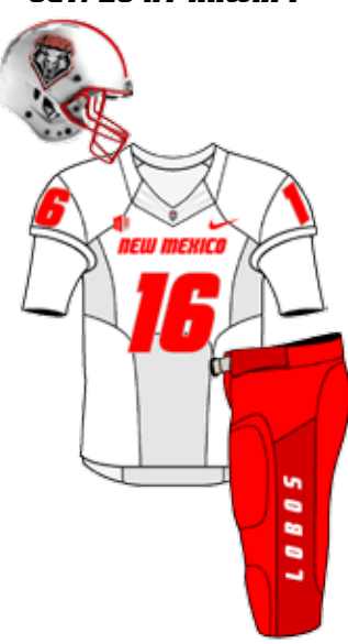
nov. 26 vs. wyoming