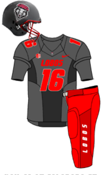
NOV. 19 AT COLORADO ST.