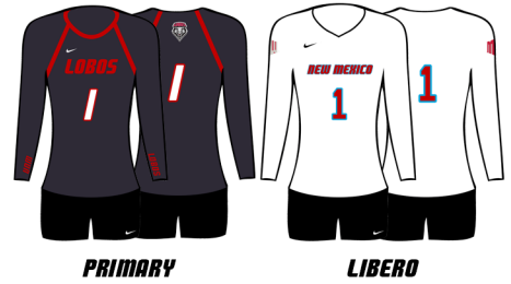
MATCH 6 · SEPTEMBER 2 NORTH DAKOTA 3, NEW MEXICO 0