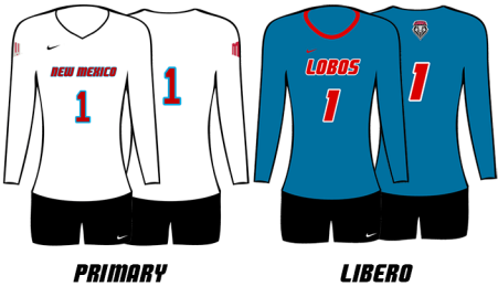
MATCH 7 · SEPTEMBER 8 NEW MEXICO 3, UT ARLINGTON 0