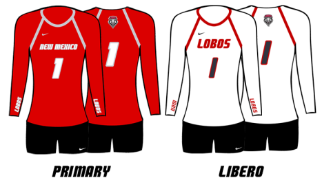
MATCH 12 · SEPTEMBER 16 NEW MEXICO 3, TENNESSEE TECH 1