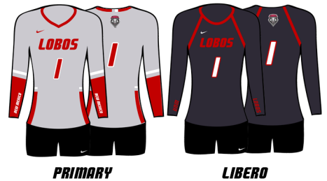
MATCH 9 · SEPTEMBER 9 NORTHERN COLORADO 3, NEW MEXICO 0