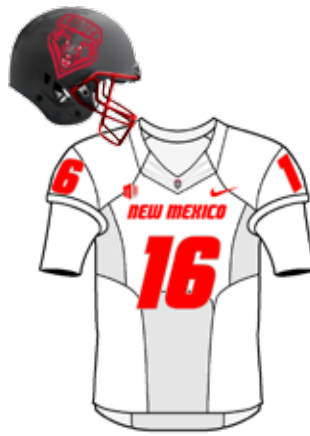
SEPT. 17 AT RUTGERS