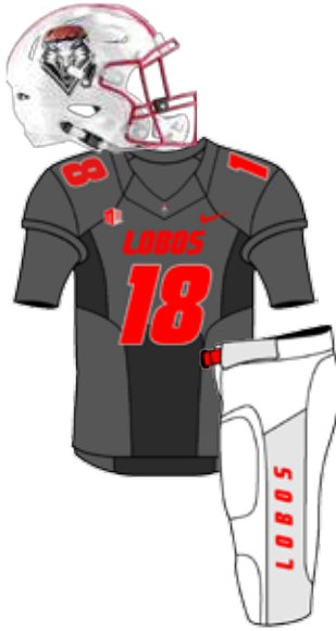
OCT. 20 VS. FRESNO STATE