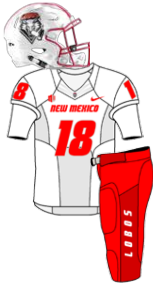
OCT. 13 AT COLORADO STATE