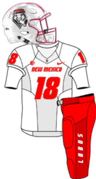
NOV. 10 AT AIR FORCE