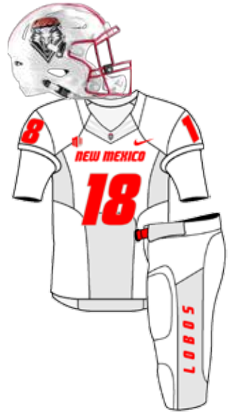
OCT. 27 AT UTAH STATE