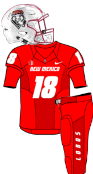
NOV. 16 VS. BOISE STATE