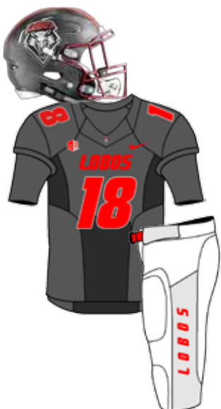
NOV. 3 VS. SAN DIEGO STATE