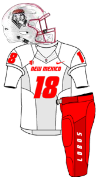
OCT. 6 AT UNLV