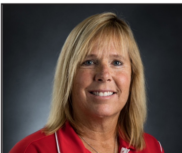
Dr. Dot Richardson UCLA, '83; Adelphi, '88; Louisville, '93 7th Season