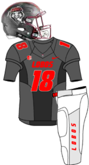
NOV. 3 VS. SAN DIEGO STATE