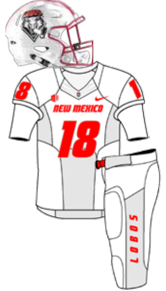
OCT. 27 AT UTAH STATE