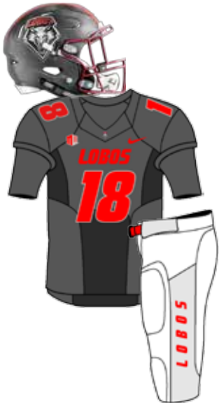
NOV. 3 VS. SAN DIEGO STATE