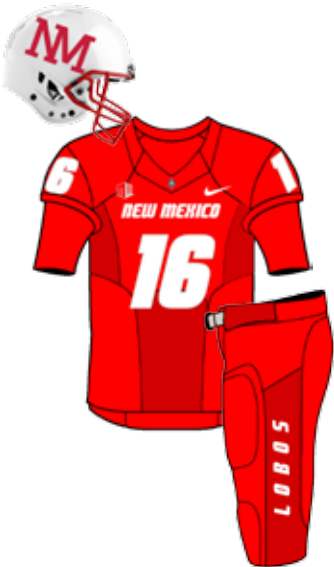
OCT. 7 VS. BOISE STATE