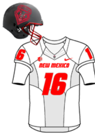
SEPT. 17 AT RUTGERS