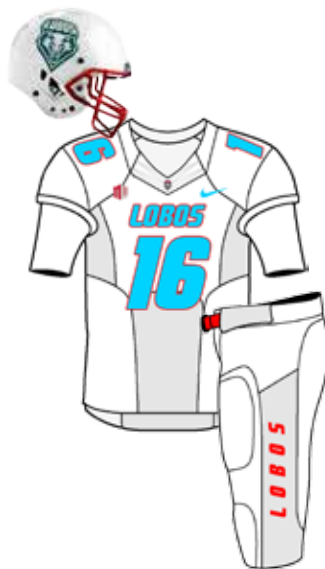
NOV. 12 AT UTAH STATE