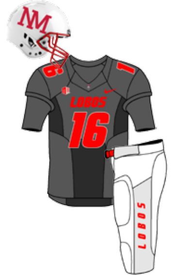
OCT. 1 VS. SAN JOSE STATE