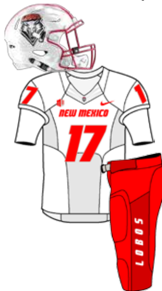
NOV. 11 AT TEXAS A&M