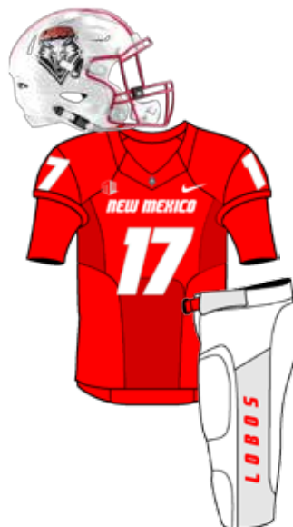
NOV. 17 VS. UNLV