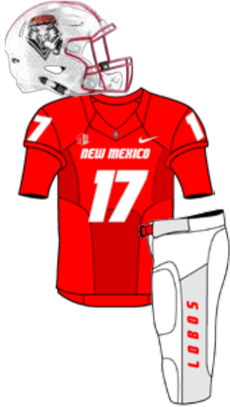
SEPT. 2 VS. ABILENE CHRISTIAN