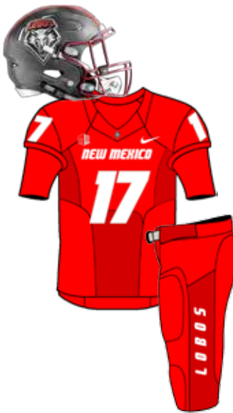
NOV. 4 VS. UTAH STATE