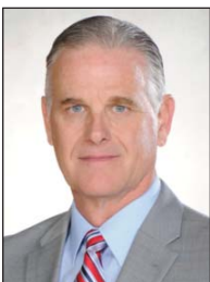
HEAD COACH BRIAN DUTCHER

PPG: 3.1 RPG: 3.7 APG: 0.4 FG%: 55.3 3FG: 0/0 FT%: 46.7