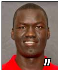
OBJI AGET 7-1 * 225 * C Fr * HS La Porte, Ind. La Lumiere HS