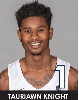
6-1 • 170 • G • FR OKLAHOMA CITY, OKLA