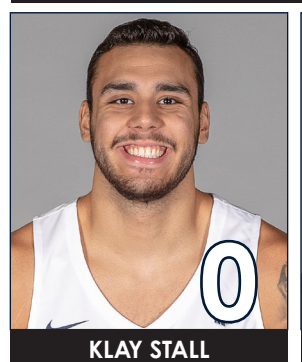
6-10 • 240 • C • SO CHANDLER, ARIZ.