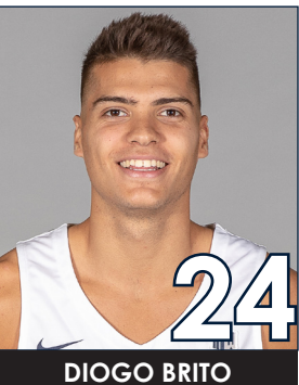
6-5 • 205 • G • JR POVOA DE VARZIM, PORTUGAL