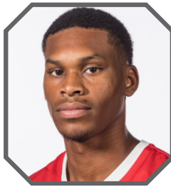
#0 • NEW WILLIAMS