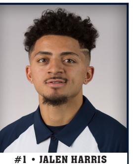
Guard • 6-5 • 195 • Junior • Transfer