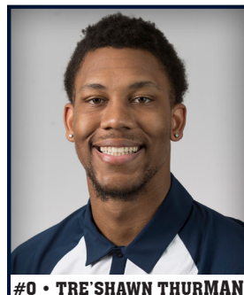
Forward • 6-8 • 225 • Senior • Transfer