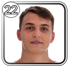
Jr. / F / 6-7 / 230 Warsaw, Poland