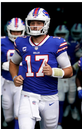
Wyoming QB Josh Allen