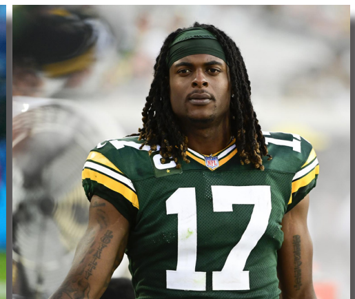
Fresno State WR Davante Adams