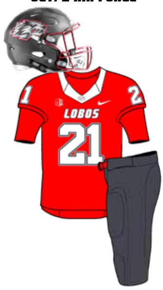
nov. 6 unlu