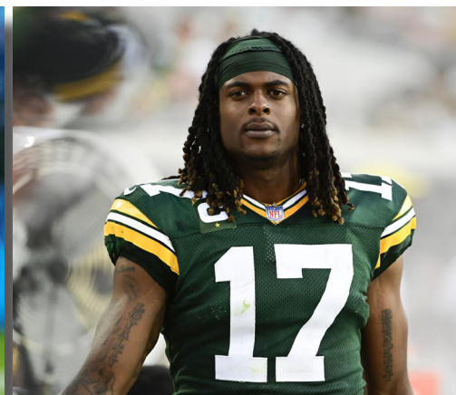
Fresno State WR Davante Adams