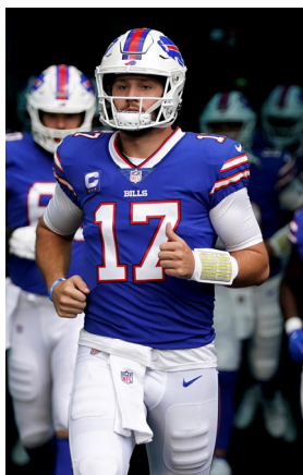
Wyoming QB Josh Allen