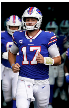
Wyoming QB Josh Allen