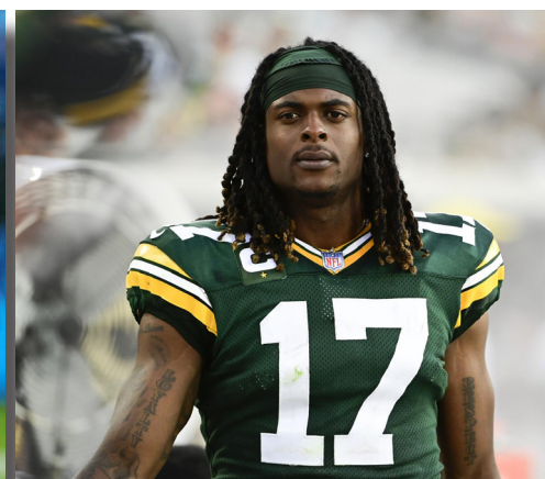
Fresno State WR Davante Adams