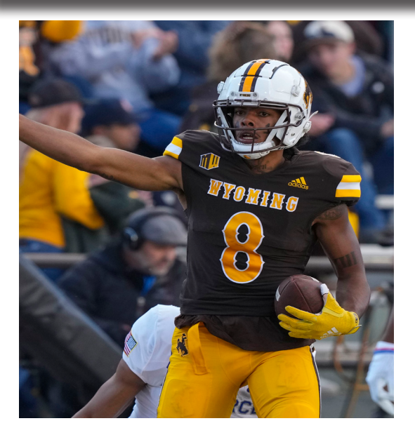
Box Score (Final) The Automated ScoreBook Air Force vs Wyoming Cowboys (Sep 16, 2022 at Laramie, Wyoming)