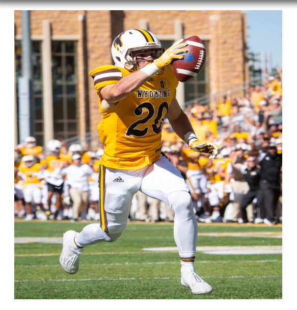
Box Score (Final) The Automated ScoreBook Tulsa vs Wyoming Cowboys (Sep 03, 2022 at Laramie, Wyoming)