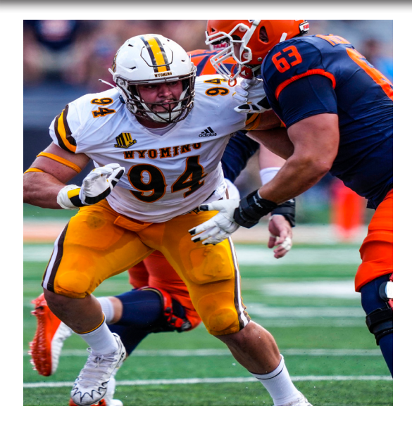
Box Score (Final) The Automated ScoreBook Wyoming Cowboys vs Illinois (Aug 27, 2022 at Champaign, Illinois)