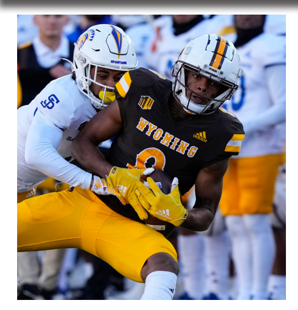
Box Score (Final) The Automated ScoreBook San Jose St. vs Wyoming Cowboys (Oct 01, 2022 at Laramie, Wyoming)