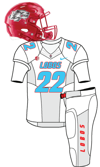
9/24 AT LSU