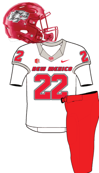
11/12 AT AIR FORCE