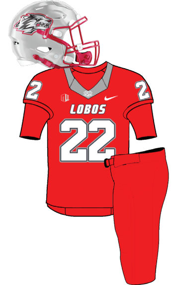
10/22 FRESNO STATE