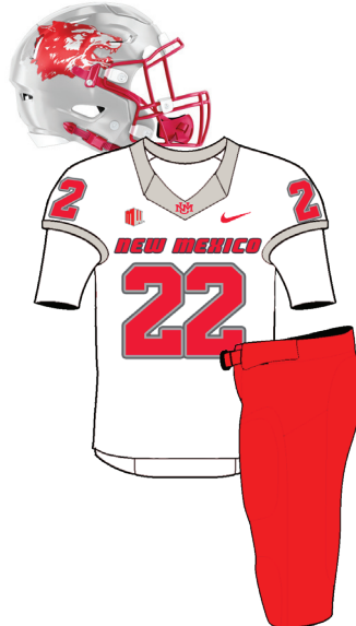
10/15 AT NEW MEXICO ST.