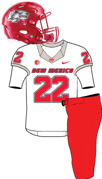
11/5 AT UTAH STATE