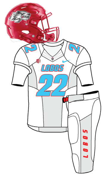
9/24 AT LSU