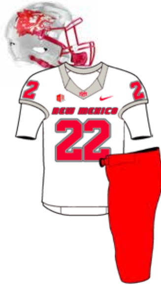
10/15 AT NEW MEXICO ST.