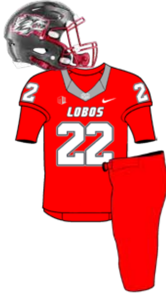
11/18 SAN DIEGO STATE