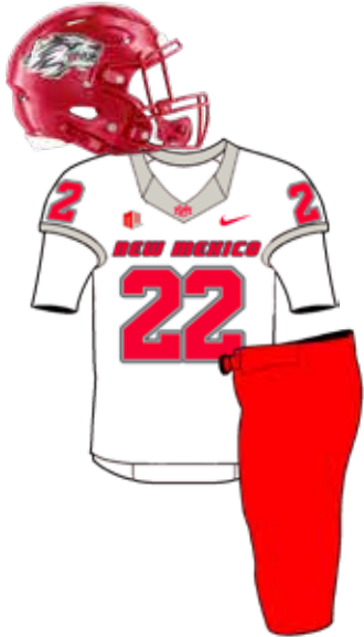
11/5 AT UTAH STATE