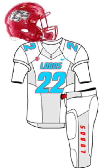
9/24 AT LSU