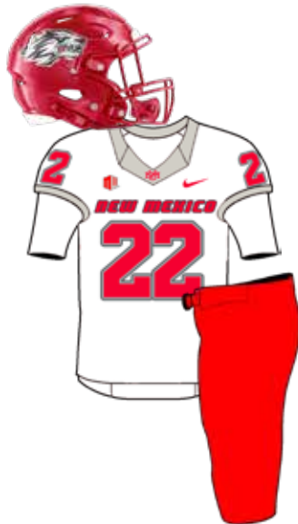
11/12 AT AIR FORCE