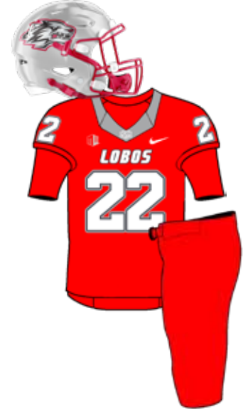
10/22 FRESNO STATE