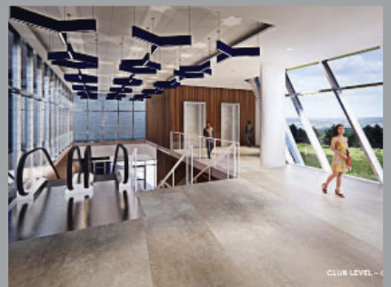
Club Level Entry