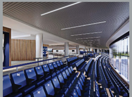
Club Level Seating