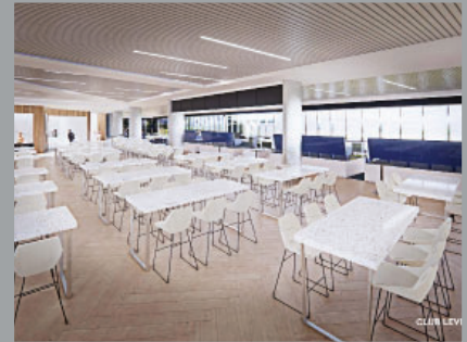
Club Level Banquet