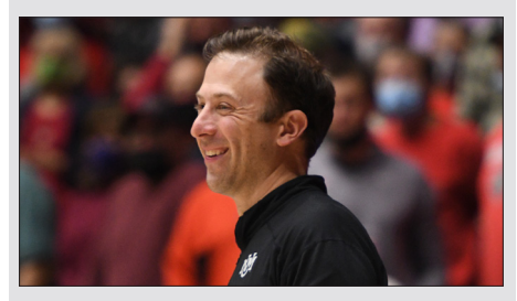
2nd Season at New Mexico